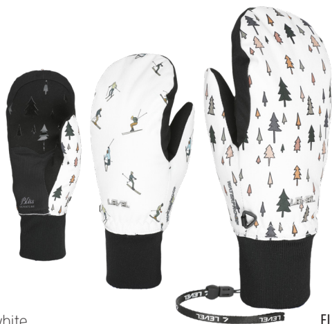
40 pk white