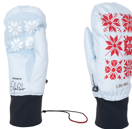
61 sky blue