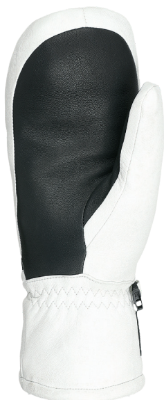
35 black white

FIT: Natural MATERIAL: Water resistant sheep leather, Water resistant sheep leather palm INSULATION: Multilayer Primaloft, Soft-touch lining with Polygiene treatment DRY TECHNOLOGY: Membra-Therm Plus SUSTAINABLE VALUE: 73% Organic FEATURES: Fur cuff, Metal studs decoration, Leather with crocodile pattern, Storm leash