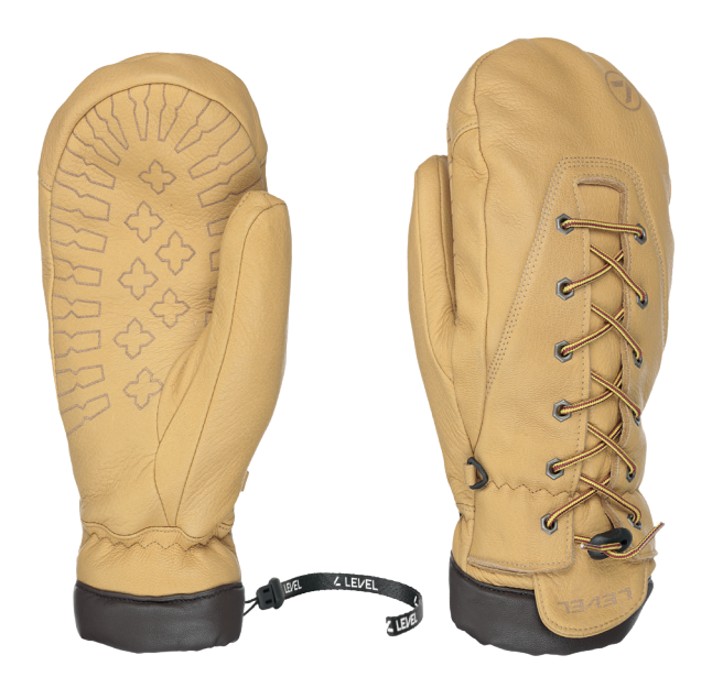
38 pk brown