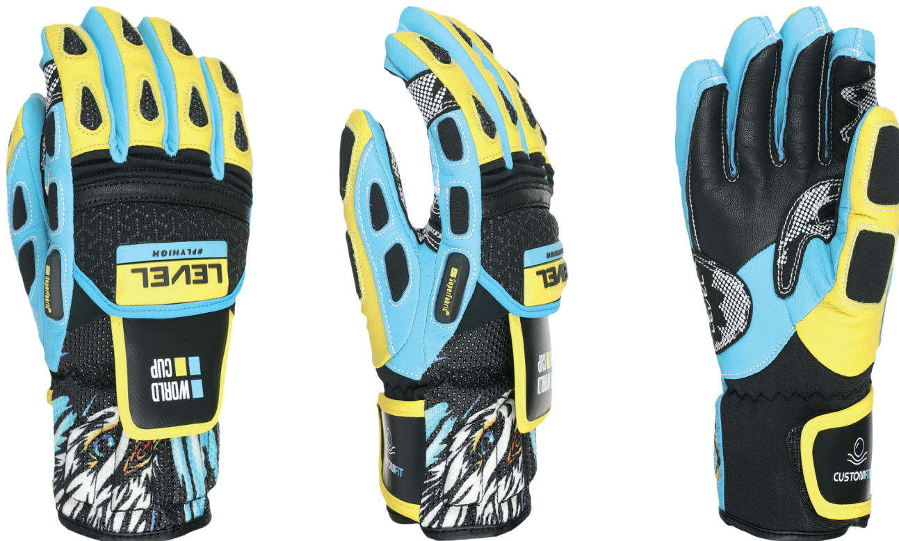
70 yellow blue