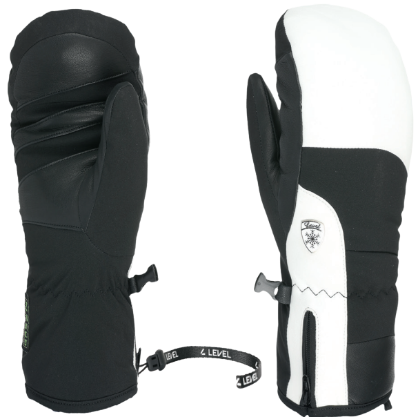
35 black white