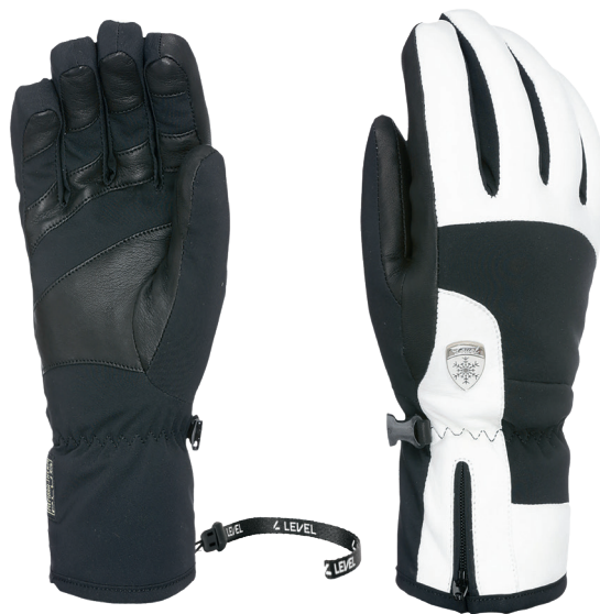
35 black white