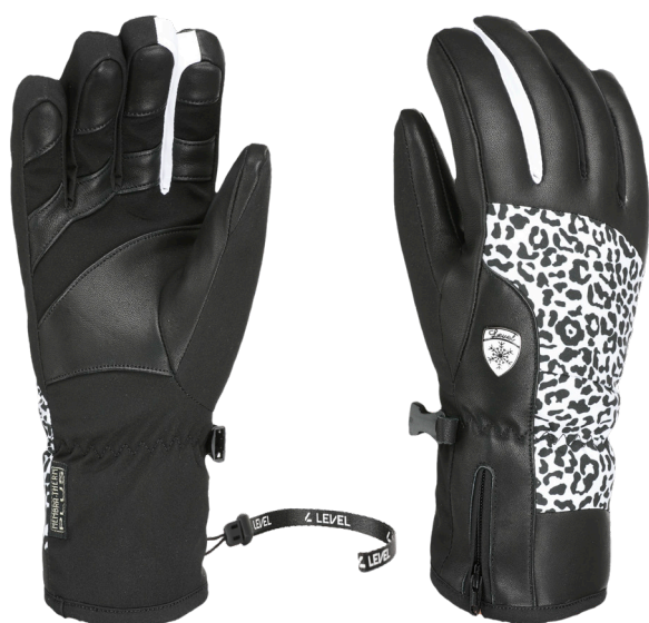
41 ninja black