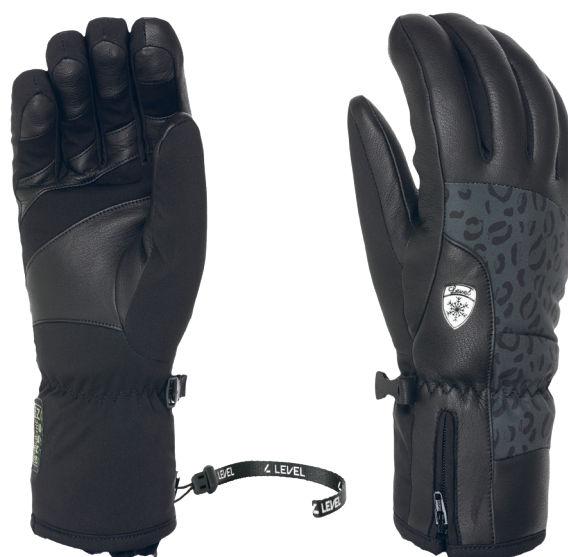
26 black camo