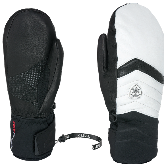
35 black white