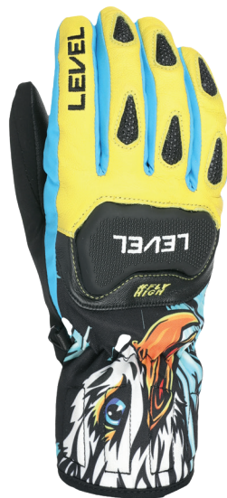
70 yellow blue