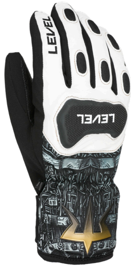
40 pk white