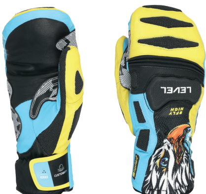
70 yellow blue

Introducing our 3D Knuckle Shape Protection – a necessity on the race course. Designed with armored protection for fingers and knuckles, ensuring a must-have hand protection for ski racers.