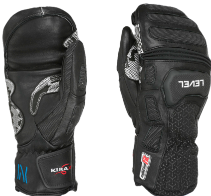
43 pk black

Graphene offers perfect thermoregulation as it distributes the heat evenly. It is antibacterial and very breathable.