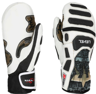
35 black white

VALUE: 60% Organic FEATURES: Sublimation on back, Silicone grip, Dyneema stitching, Superfabric, Custom Fit, Graphene lining, Finger lining inside, Durashield on back cuff