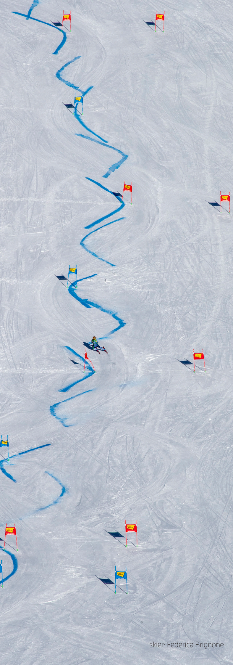
skier: Federica Brignone