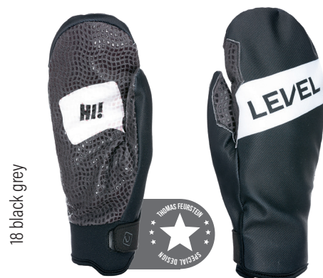
18 black grey