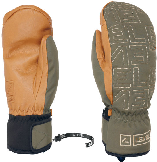
14 olive green

FEATURES: Short neoprene cuff, Hook&loop closure, Storm leash