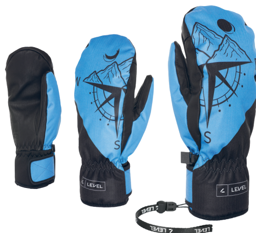
61 sky blue