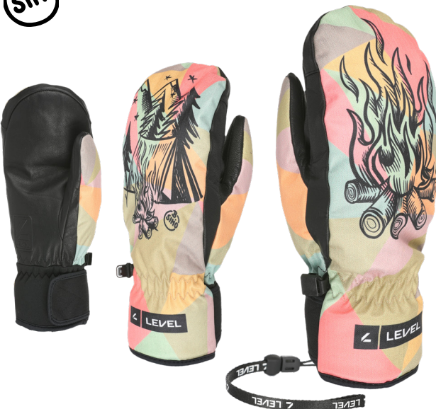
26 black camo