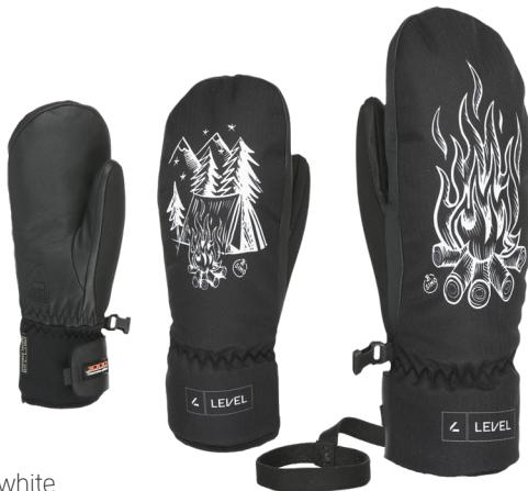
35 black white