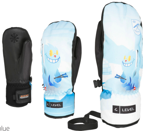
06 light blue