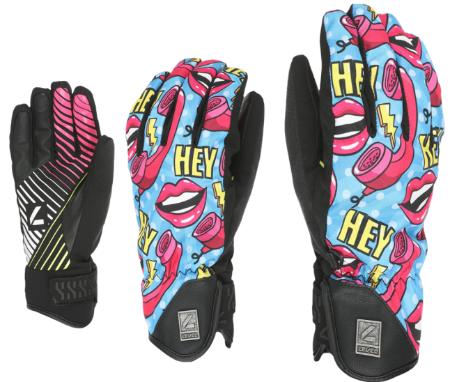
62 hot pink