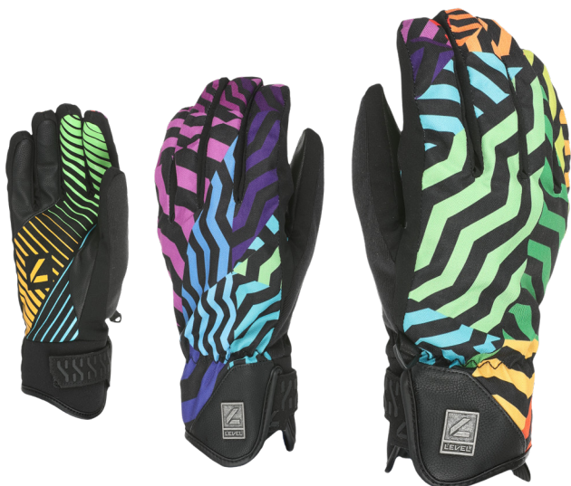
06 light blue

MATERIAL: Water resistant fabric, Silicone printed palm INSULATION: Light fleece FEATURES: Short cuff, Hook&loop closure, Nose cleaner, Storm leash