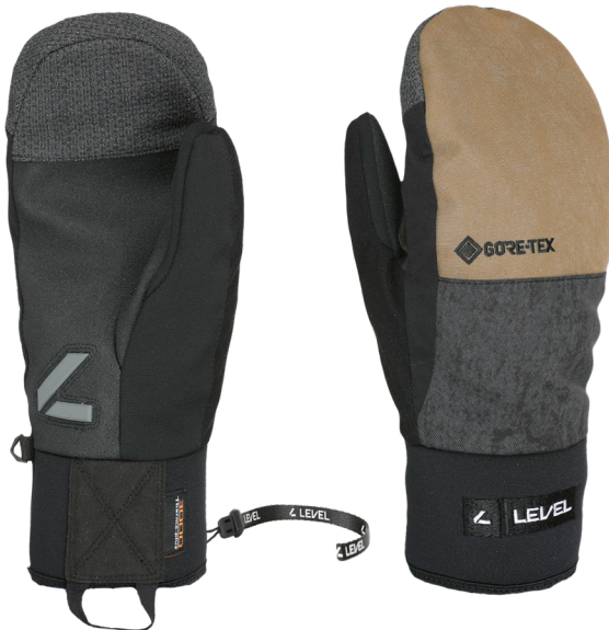
14 olive green

MATERIAL: Water resistant fabric, Griptex palm INSULATION: Fiberfill, Fleece DRY TECHNOLOGY: GORE-TEX FEATURES: Neoprene cuff, Puller, Nose cleaner, Storm leash, Finger lining inside