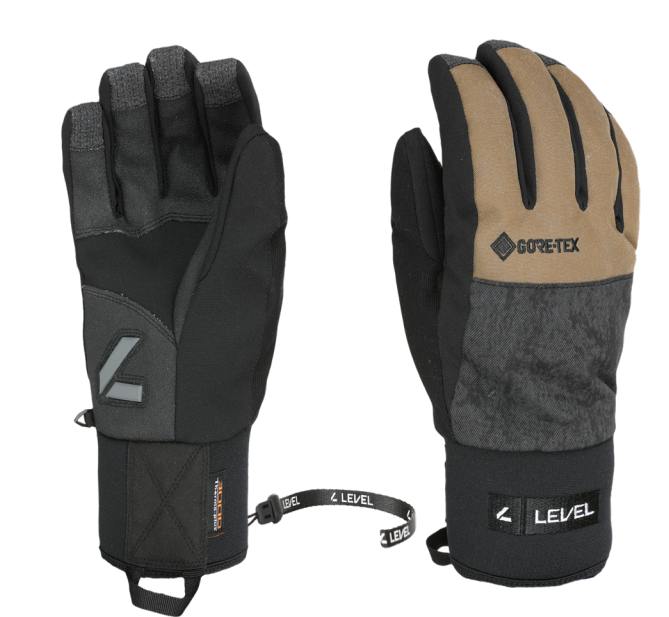
14 olive green