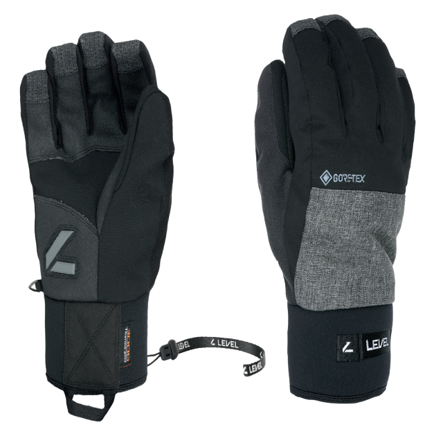
18 black grey